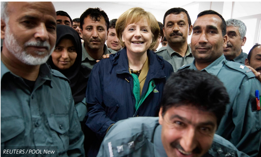
German Chancellor Angela Merkel with a group of Afghan police trainees, 06/04/2009

Civilian crisis management has become a central part of the EU's Common Security and Defence Policy (CSDP). The EU's ambitions in this field are reaching new heights, as is shown by the expanding geographical reach, the number of personnel deployed, and the operational complexity. But despite positive developments, challenges remain. In its current form, the EU runs the risk of jeopardising its own credibility as a civilian crisis manager. Capabilities, operational effectiveness, and strategic vision are all lagging behind.