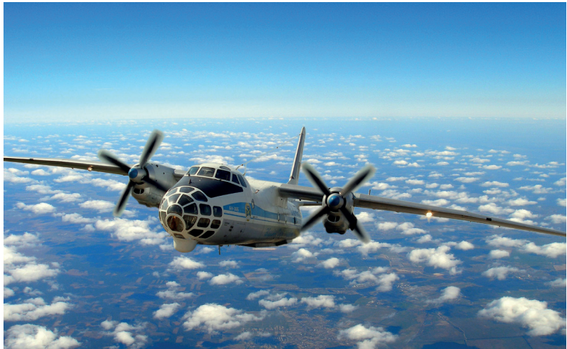
A Ukrainian Antonov An-30B aircraft used under the Open Skies Treaty. OSCE

Since reports of an impending US withdrawal emerged in October 2019, the European response has been mostly confined to the private diplomatic sphere, including some joint demarches, and to both written and verbal appeals, notably from high-level Swedish and German officials. Only immediately after the US exit declaration did eleven