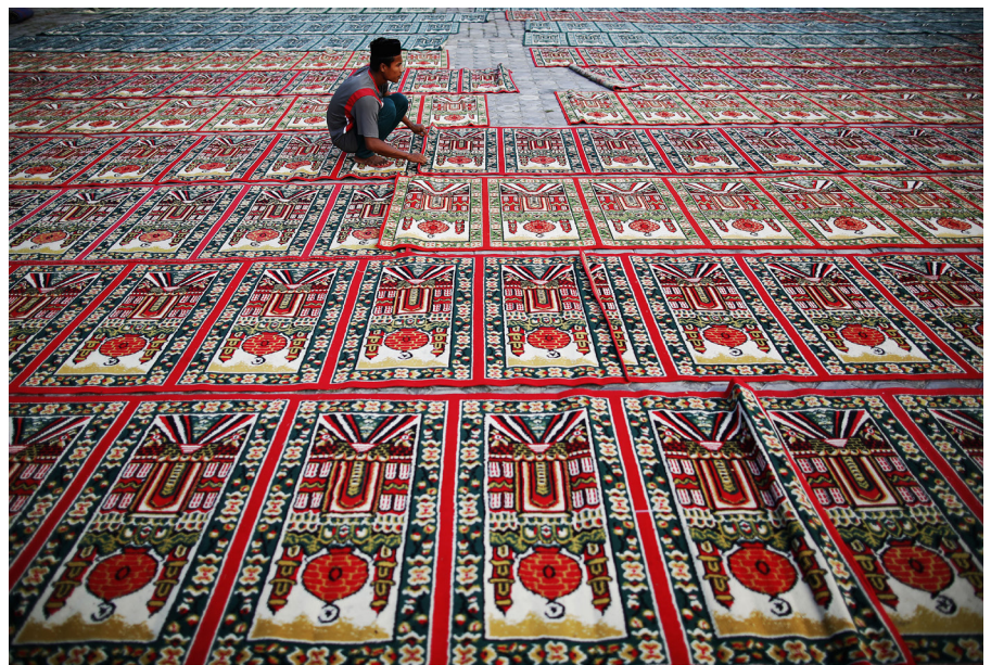
A man prepares carpets for Muslim worshippers outside a mosque in Banda Aceh. Indonesia is the world's most populous Muslim nation.

For more than three decades, Indonesia was ruled by General Suharto's military