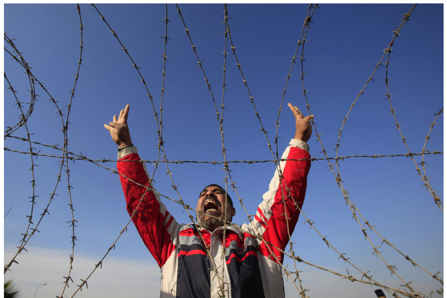
A supporter of the Muslim Brotherhood shouts slogans against the military during a protest in Cairo in January 2014.

Indeed, ties between Egypt and several Gulf States, especially Saudi Arabia, have